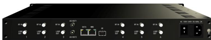
Tuner Input Version