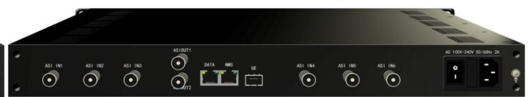
ASI Input Version